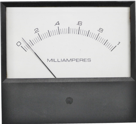
4-1/2" 4045 ■ D.C. Moving Coil 4046 ■ A.C. Repulsion