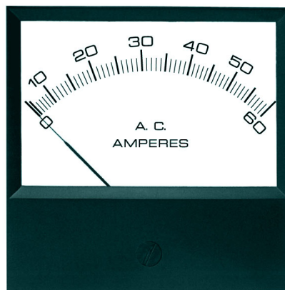
3-1/2" 4035 ■ D.C. Moving Coil 4036 ■ A.C. Repulsion