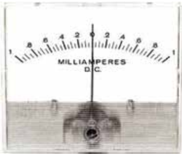
2025 2.5" DC Analog Meter 2026 2.5" AC Analog Meter